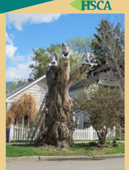
The Grotesques. A shot of the (masked) grotesque on 3rd Ave in Sunnyside.