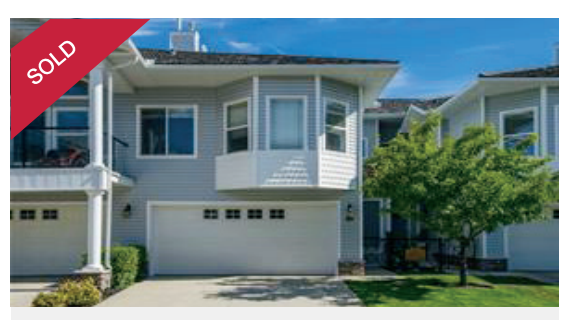
143 Rocky Vista Terrace NW List Price: $399,900 A "Common" connection. Congratulations on the purchase of your new home.

1415 21A Street NW List Price: $800,000 Congratulations to my buyer. Welcome to the neighbourhood.